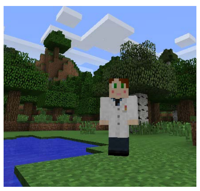
Figure 1. Researcher's avatar next to a pond in a forest in a Minecraft virtual world.

like Second Life<sup>2</sup> rather than World of Warcraft<sup>3</sup>). This allows for social play to occur in ways that might be similar to a playground, without many of the physical barriers that prevent access for those with autism (Ringland, Wolf, Faucett, et al. 2016).