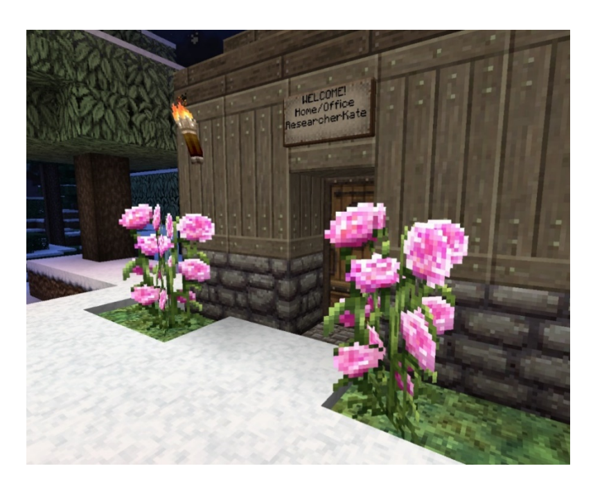
Figure 2. Home office in the Autcraft virtual world.

children on the autism spectrum and their families." The Autcraft community expresses the goal of allowing players to play without the fear of being bullied. As such, the server provides a supportive environment in which children can socialize while participating in an activity they enjoy.