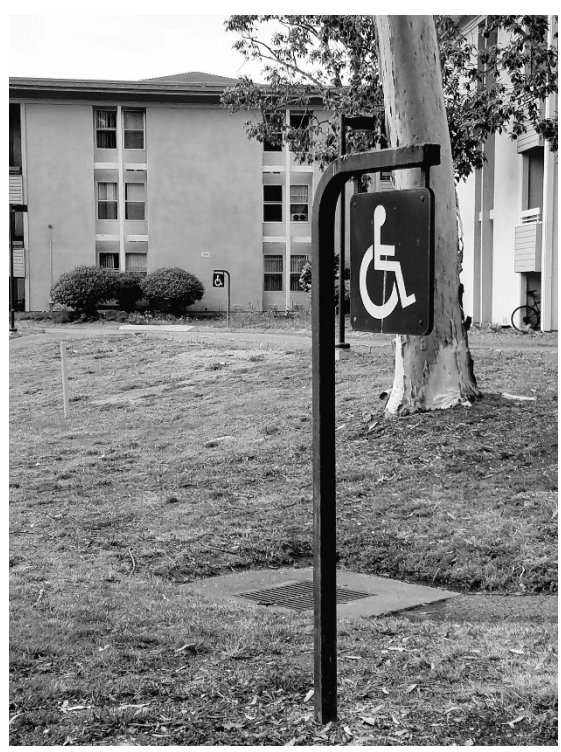
Figure 4. Accessibility placards indicating accessible routes to buildings.